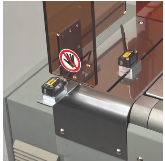
Sleep mode sensor

Conveyor Speed: Adjustable 32.8ft. to 196.8ft./minute 10 meters-60 meters/minute Tension Range: 2-70 lbs. -1/4" (5 and 6mm) machines 1 – 32 Kg 1-120 lbs.-3/8" and 1/2" (9 and 12mm) machines 1-55 Kg. Package Size: Minimum: 4.75" W x 5.2" L x .4" H 120mm x 130mm x 10mm Maximum: Depends on arch size (See chart for available sizes) Strap Size: 1/4", 3/8", 1/2" 5, 6, 8, 9, and 12mm Package Weight: 77lbs. maximum (35 Kg) Core Size: 8"x8" (200mm x 200mm) Power requirements: 110v, Single Phase 50/60Hz, 7 Amps Other power options available as an option Air Requirements: 87 PSI (for compression models only)