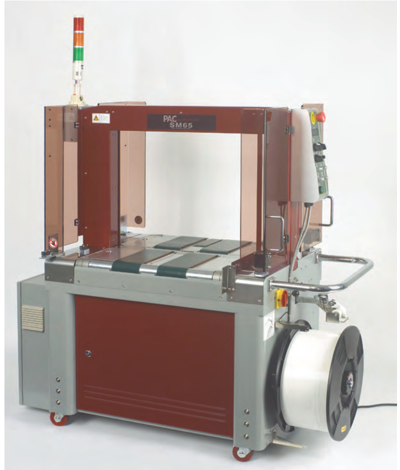
Table Height: Adjustable - 31.5 In. to 35.4 In. 800mm-900mm Lower adjustable heights available as an option

Dimensions: 54.6"W x 25.4"D x 54.5"H (without compression) 1400mm x 650mm x 1397mm 54.6"W x 25.4"D x 76"H (with compression) 1400mm x 650mm x 1950mm Weight: 496 lbs. (without compression) (Painted Machines) 225 Kg. 575 lbs. (with compression) 260 Kg.