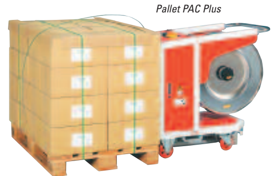
Pallet PAC Plus