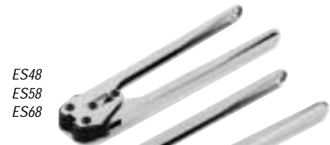
ES48 ES58 ES68