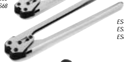
ES48L ES58L ES68L