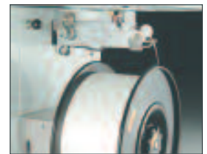
WAIST-HIGH AUTO STRAP FEEDING