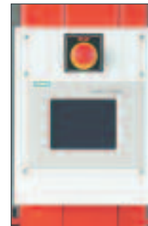
TOUCH SCREEN (HMI)